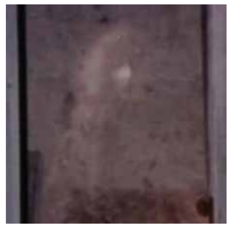
Another photo of the Pink Lady taken through a screen door.

clearest images of a "ghost" ever captured on film, which is, of course, what makes them so difficult to accept as real. If hoaxed, they are extremely well done.