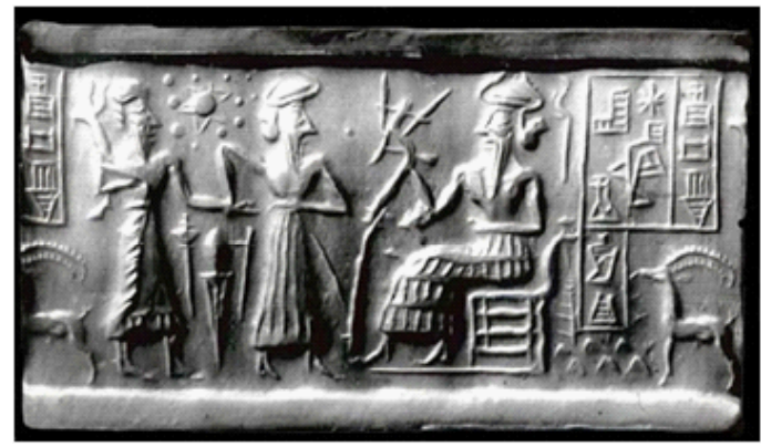
"Nibiru, Annunaki, Planet X"

collision, or near collision, of Nibiru and the planet Tiamat. The Annunaki survived the collision and came to earth and genetically engineered the human species. The mixing of Homo Erectus DNA with that of the Annunaki produced slaves to work the mines for necessary minerals required by those who came from heaven to earth."