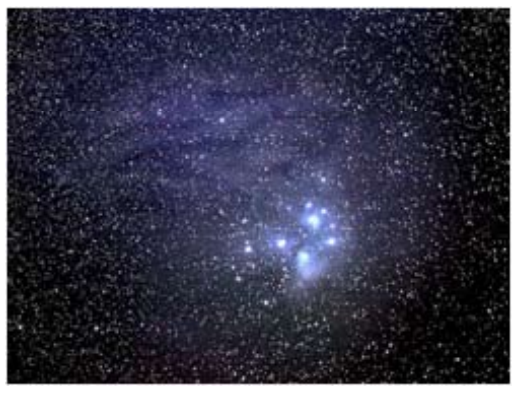
"The Pleiades on Ektachrome 100 film in 1986"

Moreover, it's been revealed that life forms can survive in environments previously thought impossible. NASA wrote on the potential of a widening Goldilocks Zone in 2003 as a function of changing perceptions of survivable environments: