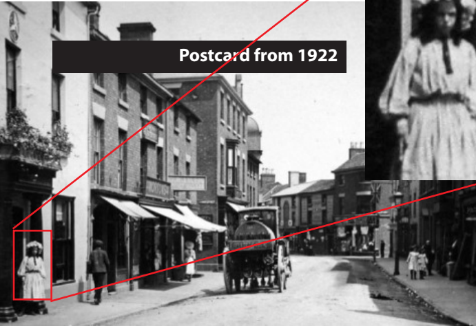
Postcard from 1922

The photo of the little girl looking out a burning building taken in Wem, Shropshire, England in 1995 has generated a lot of controversy over the years. Recently, however, the Shropshire Star News (the county in which the town of Wem is located) has published an article that may solve the mystery once and for all. Apparently, one of the newspaper's readers noticed a little girl standing in the corner of an old postcard taken of Wem, England in 1922 that looks very much like the girl in the famous photo. The photos are compared side-by-side below.